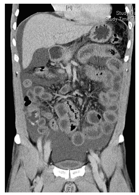
Fig. 2 Computed tomography at admission shows colon wall edematous changes and moderate ascites.

1683/uL. The total protein and albumin in the ascites were 6.2 g/dL and 3.6 g/dL, respectively (serumascites albumin gradient: 0.1). There were no malignant cells on cytological examination of the ascites. The gram stain and culture of the ascites were negative. Stool collected for routine analysis and culture was negative for pus, mucus, parasites and ova, but the fecal occult blood test result was 2+. The urinalysis was normal without proteinuria or hematuria.