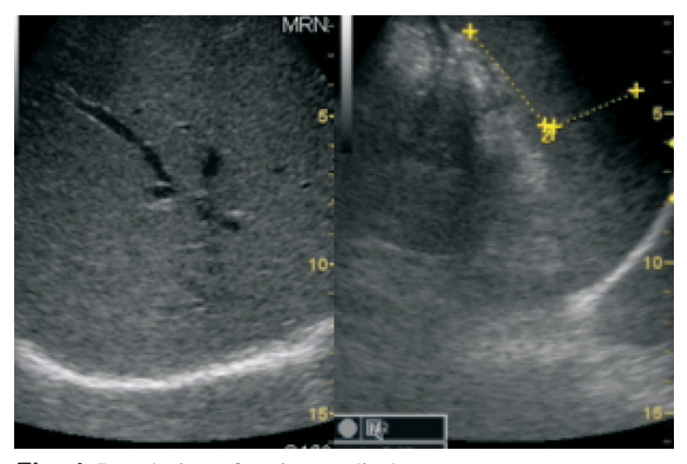
Fig. 4 Resolution of ascites at discharge

Our patient was a 43-year-old man. EG predominantly affects men at around the third to fourth decade of life, but it can also affect patients of other ages.<sup>(1)</sup> This patient had recurrent episodes of epigastralgia several times in previous years. Previously, repeated panendoscopy and colonoscopy revealed only shallow peptic ulcers. His previous diagnosis