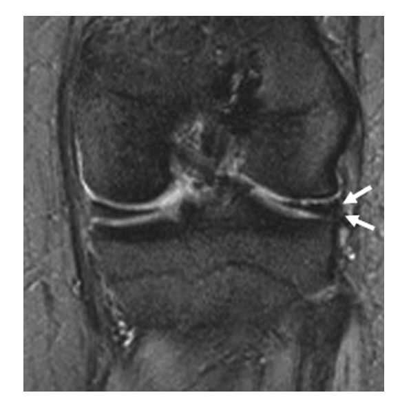
Fig. 3 Magnetic resonance imaging demonstrates a complete healing of the torn lateral meniscus after all-inside meniscal repair with the FasT-Fix meniscal repair system at one year postoperatively (white arrows). The patient had returned to vigorous sports with excellent knee function.

At the most recent follow-up, no symptoms of meniscal tears were observed in 30 (96.8%) cases (Fig. 3). One patient (3.2%) reported tenderness on joint-line palpation. No patient had exhibited any locking episodes. Only one case (3.2%) was consid-