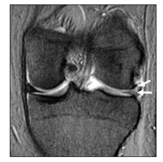
Fig. 1 A 25-year-old male with a basketball injury had experienced pain, locking, and effusion in his left knee for 3 weeks. Magnetic resonance imaging demonstrated a peripheral tear of the lateral meniscus (white arrows).

From October 2004 through September 2006, 31 arthroscopic meniscal repairs in 31 consecutive patients were performed by the senior author (YS Chan) using the FasT-Fix Meniscal Repair Suture System (Smith & Nephew) and the arthroscopic technique described below. In this prospective study, pre-operative evaluations included assessment of any effusion of the injured knee joint, the joint's range of motion, the stability of knee joint, the joint line tenderness, and an administration of the McMurray test. All patients had a magnetic resonance image study of the injury to the knee (Fig. 1). The inclusion criteria for this study were (1) a vertical full-thickness tear greater than 10 mm in length, (2) the location of the meniscal tear being less than 6 mm from the meniscocapsular junction,<sup>(14)</sup> (3) fixation of the meniscus solely with the FasT-Fix system, (4) no former meniscus surgery, and (5) no evidence of arthritis during arthroscopy. Isolated anterior cruciate ligament (ACL) deficient knees without concomitant collateral ligamentous injuries were reconstructed using a hamstring autograft at the time as the meniscal repair. Institutional Review Board approval (CGMH 98-0563B) was obtained before initiating the study. All patients gave their informed consent to participate.